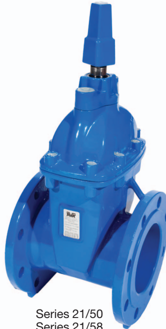
Series 21/50 Series 21/58