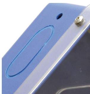
Ports available allowing standard design versatility for switches.