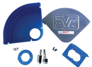
Contents of kit.