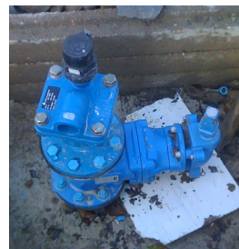
gate valve with bevel