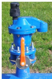
Butterfly valve with lever

ISOLATION: AVK always advocate the use of an isolator with an air valve in order to facilitate isolation. Typically these can be ball valves, gate valves or butterfly valves, depending on the installation details.